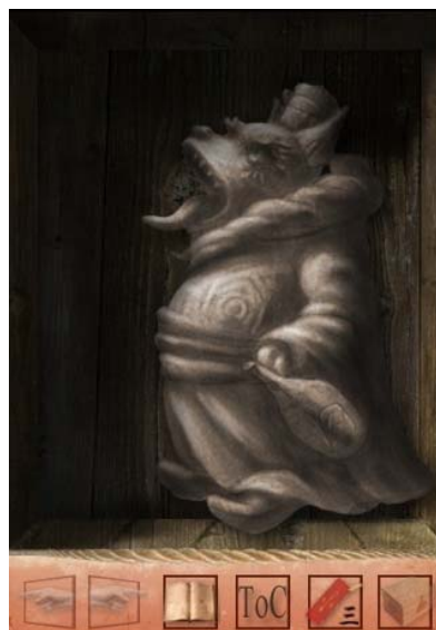
Netsuke Sculpture of a Yokai