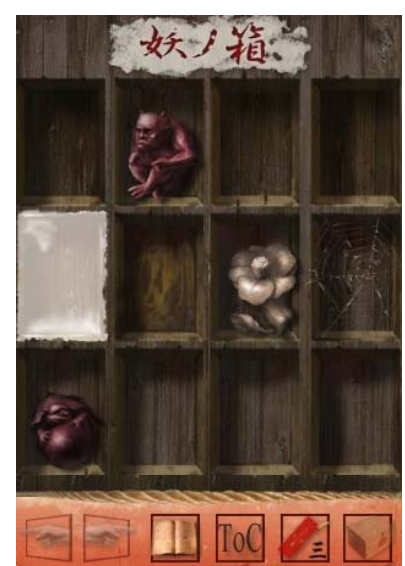
Yokai Collection Box